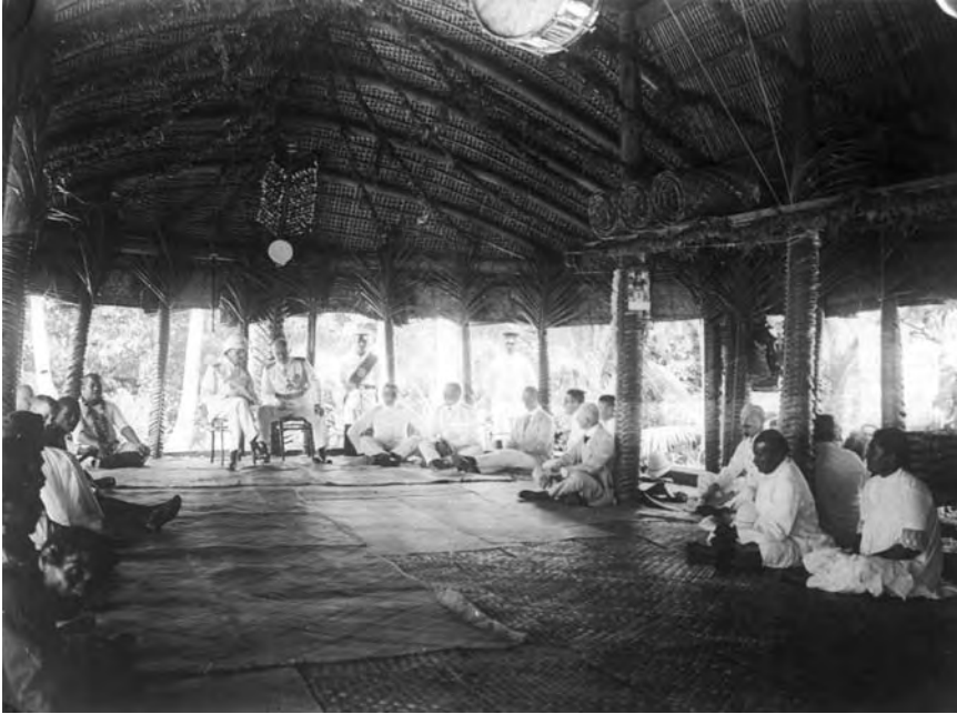
Figure 2 Governor Erich Schultz leading a fono with Samoans.

Other colonial interventions shielded Samoan life from the encroachment of the capitalist value form and commodity relations. The Germans prohibited the sale or leasing of Samoan-owned land to foreigners and resisted settler demands that the Samoans should be forced to work on European-owned plantations. Because the Germans could not understand how sacred mats were distinguished from lesser quality mats, or how the value of the latter was determined, Solf created an office to assess the value of fine mats and attach a government stamp to them. By exempting heirloom-quality mats from this process the government prevented Samoans from mixing monetary and sacred value systems in ways that did not make sense from a European perspective. In another example of enforced traditionalism, the government tried to coax the Samoans back into practices they were abandoning, urging them to use traditional roofing materials rather than corrugated metal on their houses. 20 The use of manufactured materials in housing was one step towards limiting the traditional migratory mobility of Samoans, since western-style homes involved greater investments and sunk costs than a traditional fale .